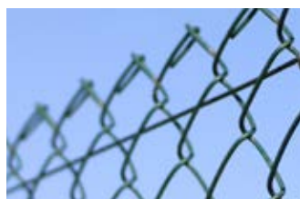
Coated Chain Link