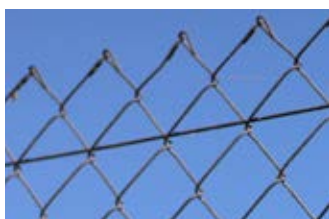
Galvanized Chain Link