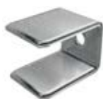
End / Intermediate