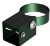
End / Intermediate / Angle