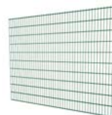
Twin Wire Panel